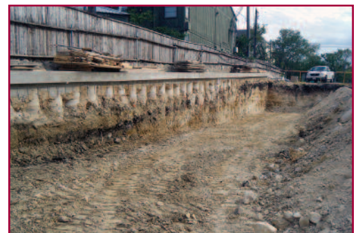
THE TAU TRUSTEES HAVE IMPLEMENTED A VARIETY OF POLICIES TO MAINTAIN THE INTEGRITY OF OUR NEW HOME.