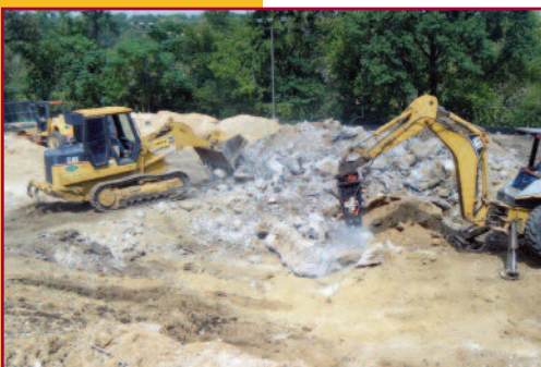
AT THE END OF OCTOBER WE COMPLETED THE BUILDING EXCAVATION WORK AND THE EAST RETAINING WALL.

$5 Million Goal $3,156,816 Total Contributions 17% Participation 259 Contributors