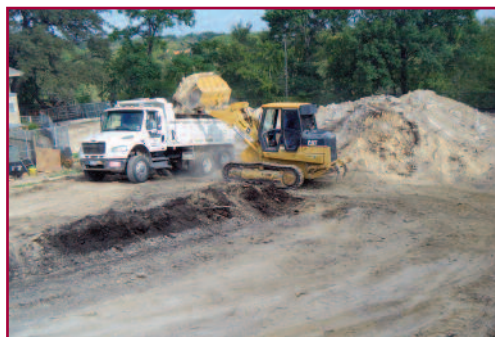
WE HAVE BEGUN DRILLING THE PIER WORK ON THE FOUNDATION.